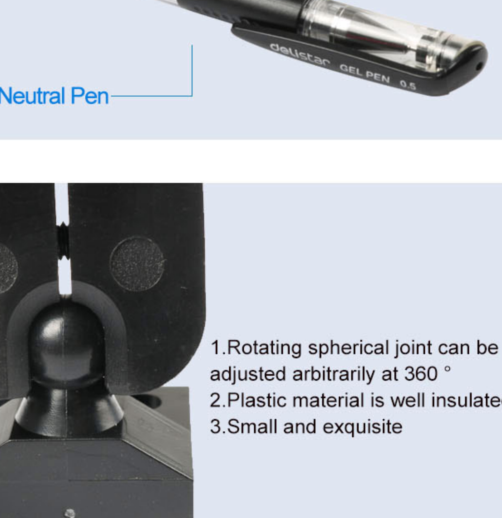
Normal Neutral Pen