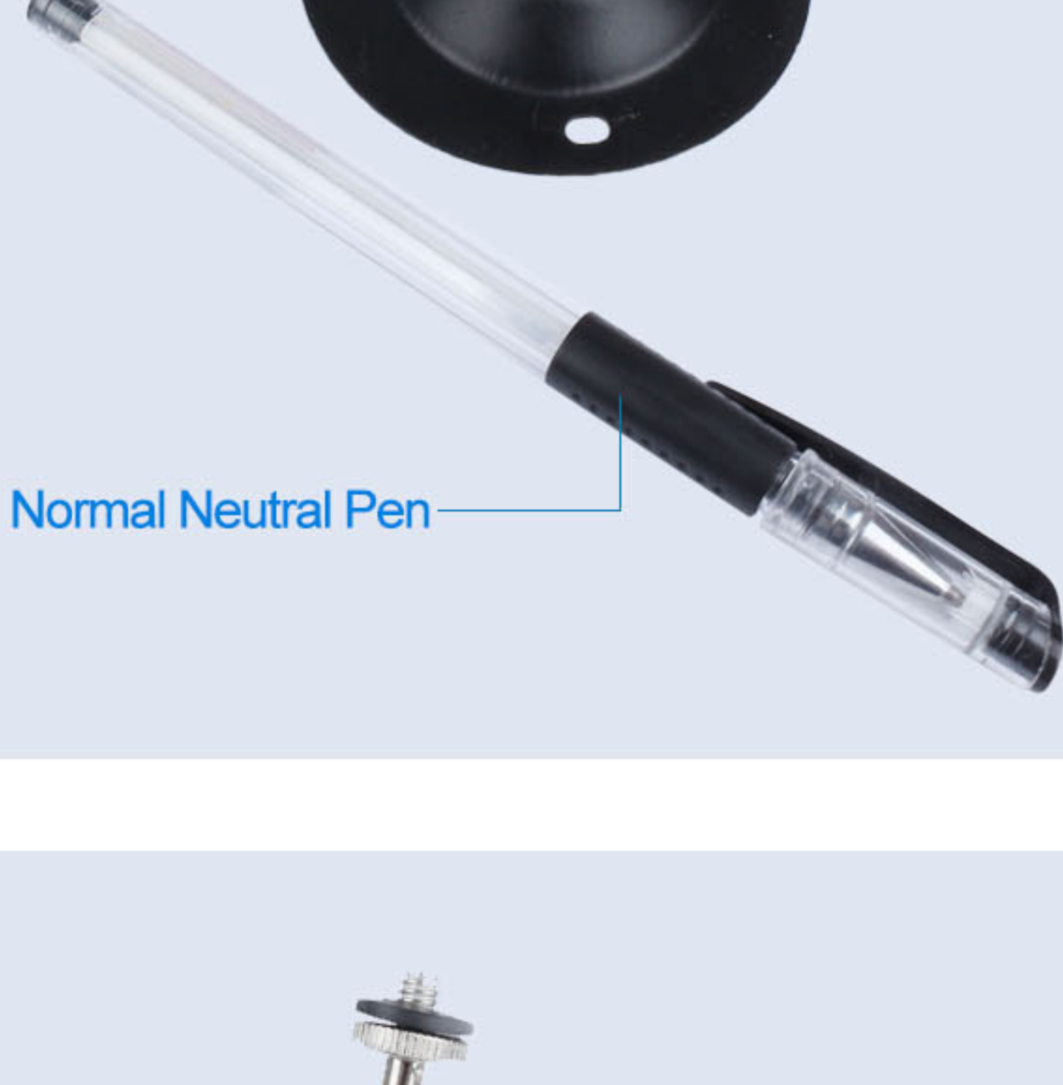
Normal Neutral Pen